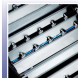
Stainless Steel Flav-R-Wave™ Cooking System