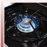
Powerful Side Burner