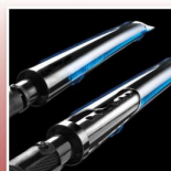
Stainless Steel Dual-Tube™ Burner System