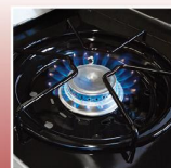
Powerful Side Burner