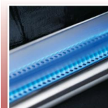
Stainless Steel Rear Burner