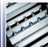
Stainless Steel Flav-R-Wave™ Cooking System