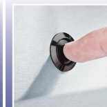
Deluxe Electronic Ignition System