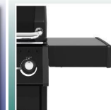
Stylish Steel Side Shelves